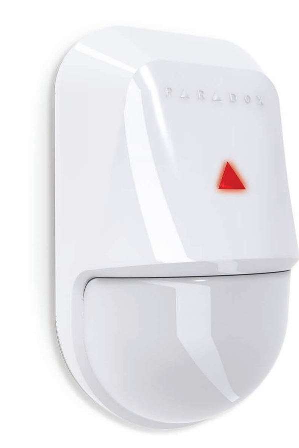
Paradox Partners say: "NV5 is a marvel."